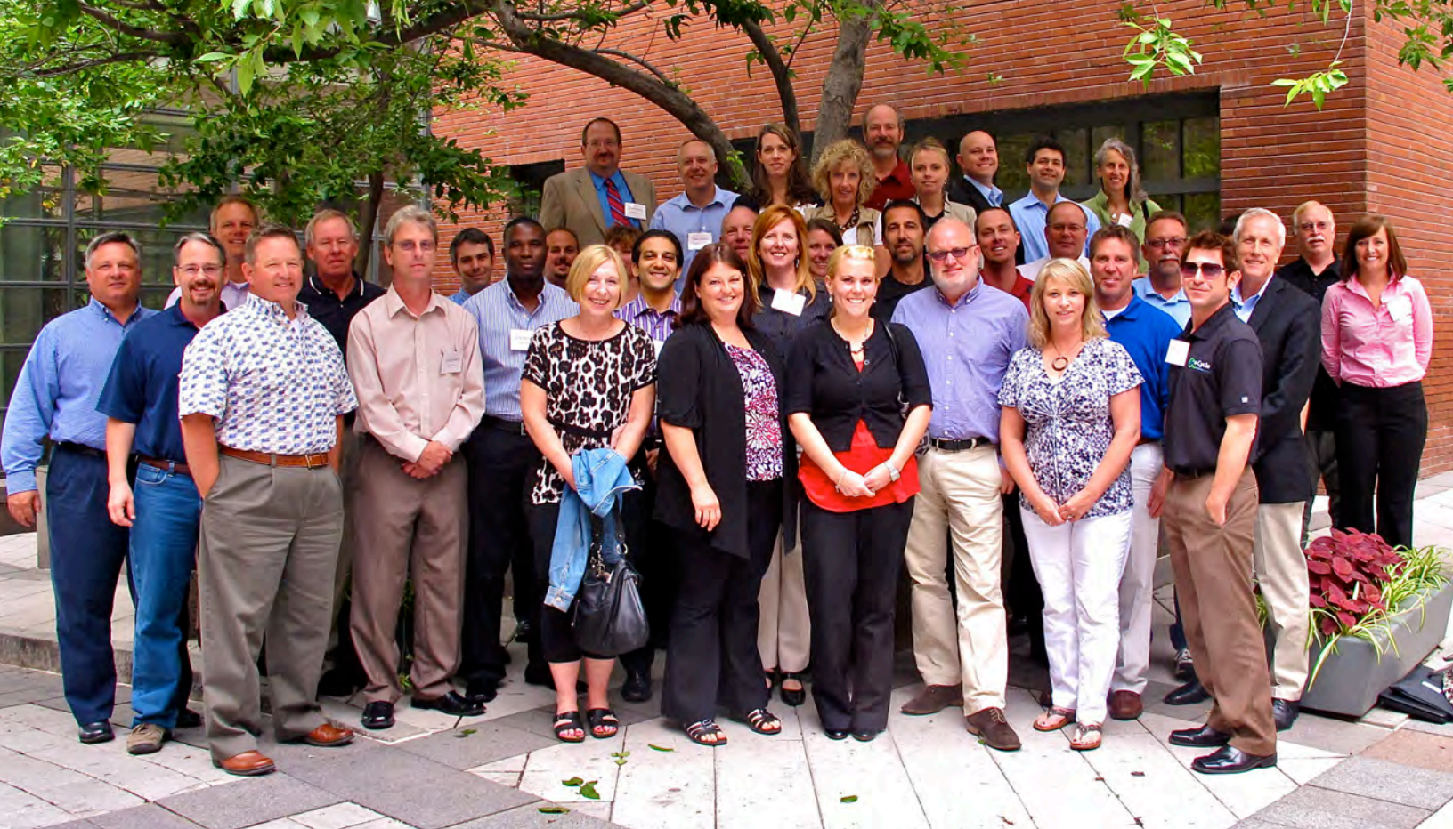
A gathering of e-Stewards Recyclers at the most recent face-to-face meeting in St. Louis (2012)