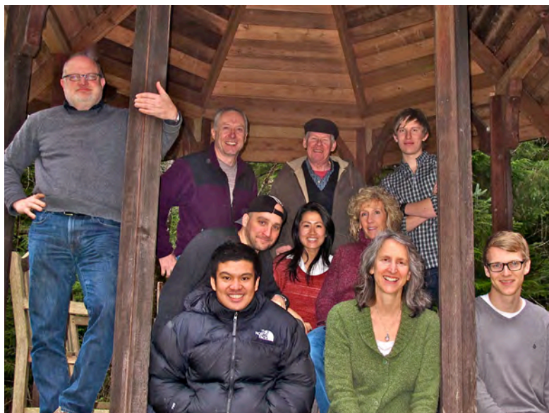
The BAN staff

THANK YOU FOR YOUR SUPPORT, now and in the important days to come.