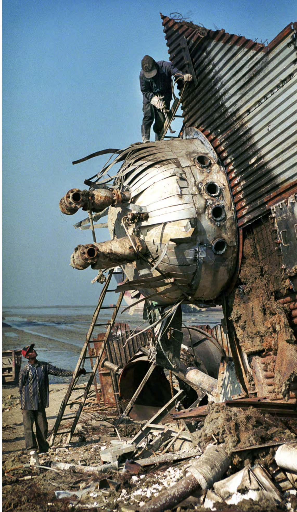
Hazardous waste on the beach... asbestos pours out of ship hull in Alang, India