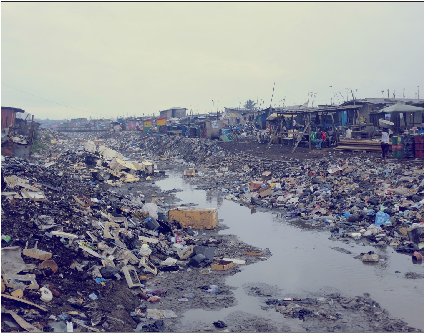
Odow River, Agbogbloshie dump, Accra, Ghana.