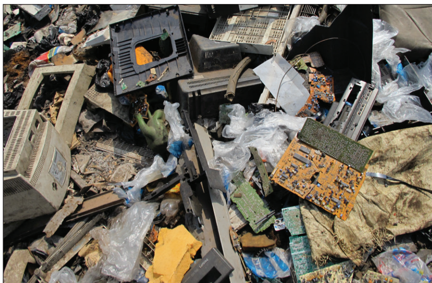
A pile of electronic waste in the Agbogbloshie dump in Ghana.

10 persons. As much of the waste trade is conducted by small brokers and collectors, the data becomes even more hopelessly skewed due to this buried fact. BAN and the Electronics TakeBack Coalition published a critique highlighting these shortcomings soon after the study was published (available at tinyurl.com/ITC-Statement ).