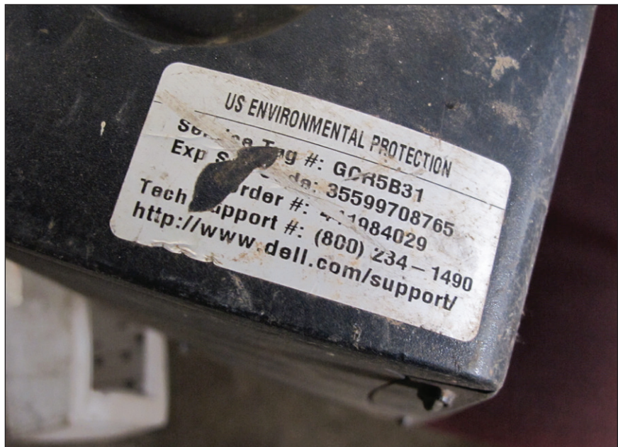
An U.S. Environmental Protection Agency identification tag on a PC casing.