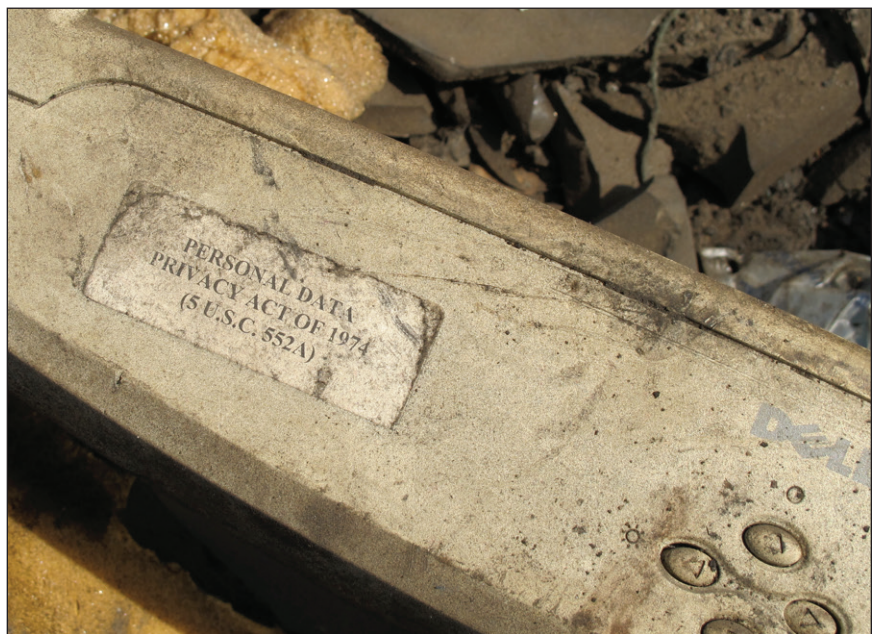
An ID tag on a monitor casing found in the Agbogbloshie dump in Ghana.

In the MIT study, much like Lepawsky’s, the authors unfortunately based their research on the HTS codes that don’t exist for e-waste, but did not even bother to find a proxy for used or waste equipment of any kind. They simply used the codes for new electronics and then presumed those would be the same codes used by importers