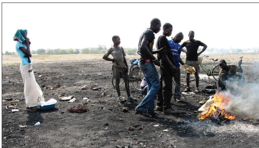
Young men and boys burning electronics at the Agbogbloshie dump. Accra, Ghana.

When the final report was published in 2013, once again, a stunningly low figure of 7 percent export was presented. But what is not well understood was that this represented 7 percent of sales amounts, not weight. Low-value material is much of what is exported in the e-waste trade and value does not correspond at all to weight. Nor does value correspond to environmental harm. We learned also that the survey did not even get sent to companies of less than